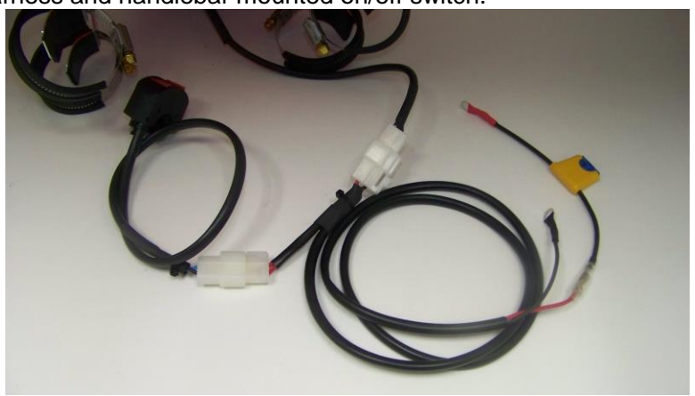
Baja Designs harness w/switch part# 61-1049

We recommend using Baja Designs harness w/switch part# 61-1049 which comes complete with a fused harness and handlebar mounted on/off switch.